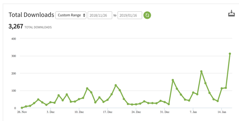
Chart shows daily downloads

Get more visibility for your Opportunity Zone fund, real estate development, or professional services by advertising on OpportunityDb.